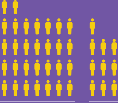
Risk Management & Economics & Finance (30) Insurance (22)

Of the 81 scholarship winners, just 22 are RMI majors, signaling interest and opportunity across many different disciplines.