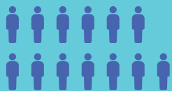
Business Administration & Accounting (13)