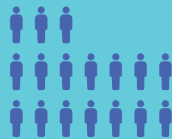
Risk Management & Insurance (17)